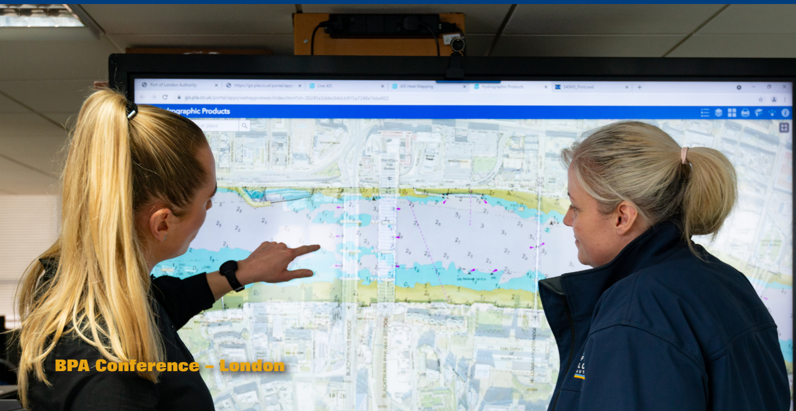
BPA Conference - London

There are three opportunities which will be tailored to your organisation's requirements. High visibility is assured when partnering at the British Ports Association 2023 conference. There will be media coverage in the months leading up to the conference, sole sponsorship of an evening networking event plus, all the perks of sponsoring and exhibiting. Email bpaconference@cl-events.com for further details on these bespoke packages to ensure your presence makes an impression on all delegates.